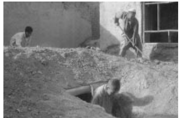
Family digging a bomb shelter behind their house in Kabul, Afghanistan

From the Draft Programme of the Revolutionary Communist Party, USA