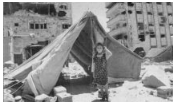
Palestinian girl by a tent set up near her family's destroyed home in a Gaza Strip refugee camp.