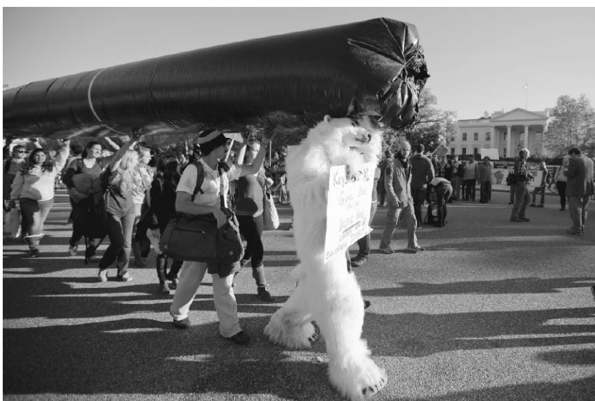
Protesters carry a replica of Keystone XL oil pipeline to protest increasing the amount of oil flow from tar sands in Alberta, Canada.