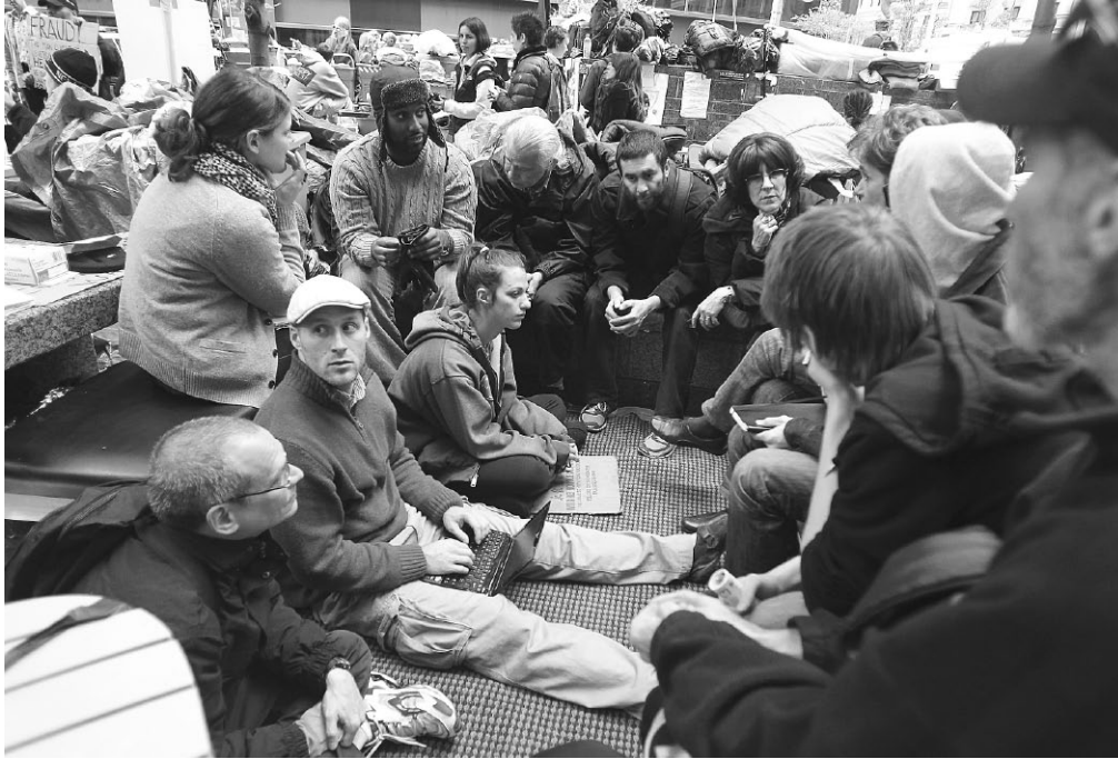
Occupy Wall Street: One of the various working groups that meet throughout the day to discuss plans.