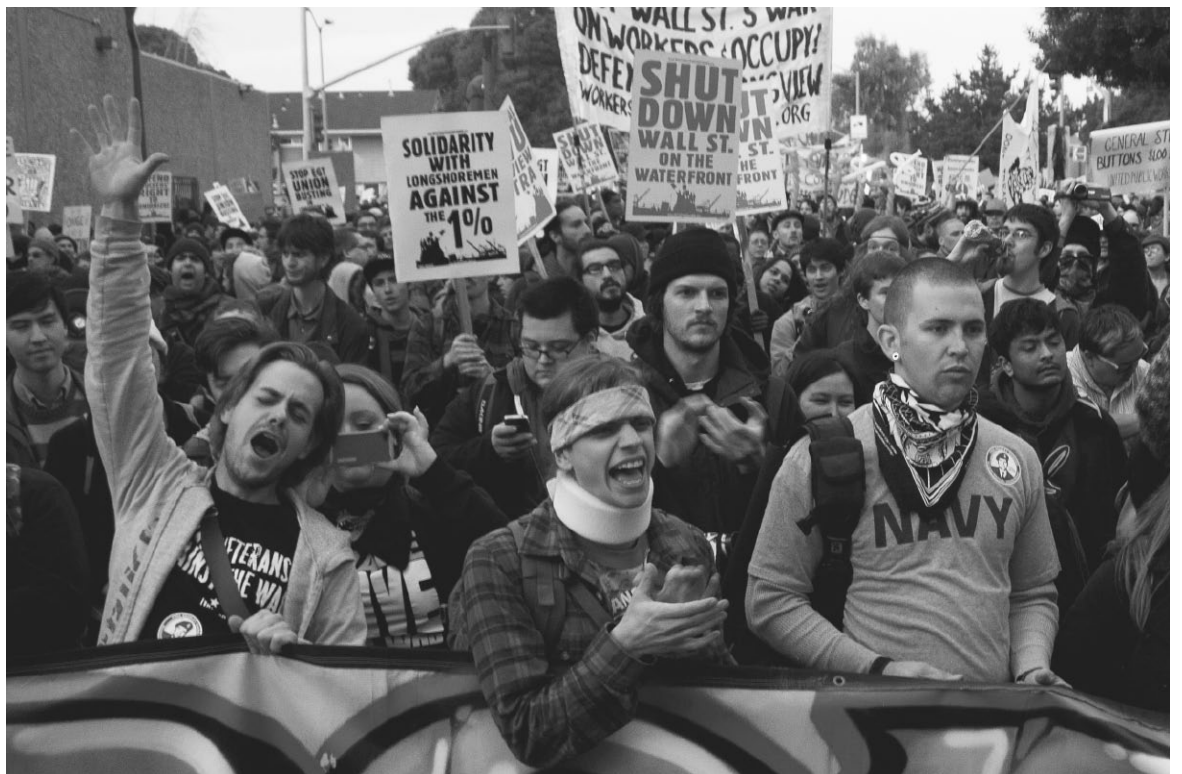
December 12—Coordinated actions by West Coast Occupy movements disrupted, and in some cases shut down, ports up and down the West Coast. These actions by thousands and thousands, were a significant continuation of resistance to the heartless and oppressive domination and way of life under this society. The actions also represented a powerful response by the Occupy movement to a coordinated nationwide effort by authorities to attack and crush the movement with police raids and brutality, and to coerce the movement into acceptable channels.

A fresh wind of resistance rose up in September when people occupied Zuccotti Park near Wall Street, the financial heart of the U.S. empire. The Occupy protests spread to cities across the U.S., bringing to the surface profound discontent with the inequality and injustice in this society, and this movement has raised the hopes of millions in this country and worldwide. The atmosphere and discourse in society is changing, and millions are thinking about and asking big questions about the ways things are—and whether and how a different future would be possible. This movement has been repressed by the powers-that-be in what appear to be coordinated attacks to savagely evict encampment after encampment across the country. As 2011 comes to a close, this movement stands at a crossroads.