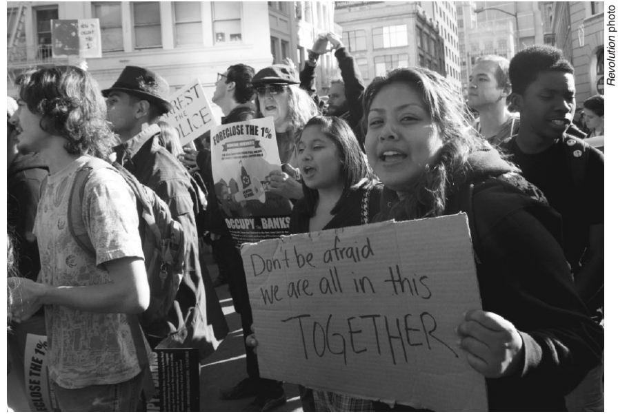
Occupy Oakland marching on the day of the general strike.