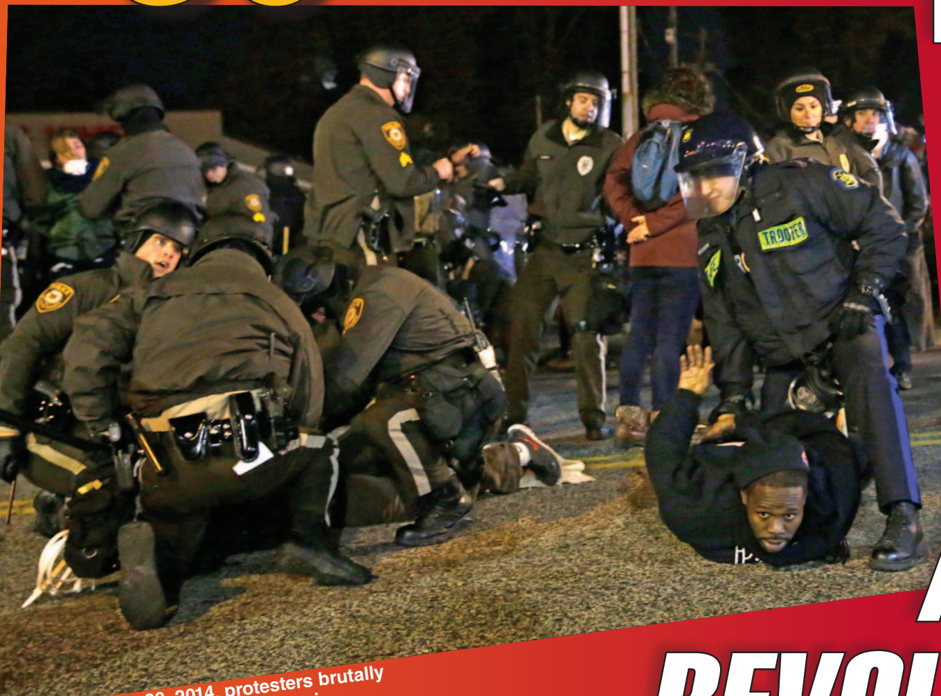
November 28, 2014, protesters brutally arrested in Ferguson, Missouri.