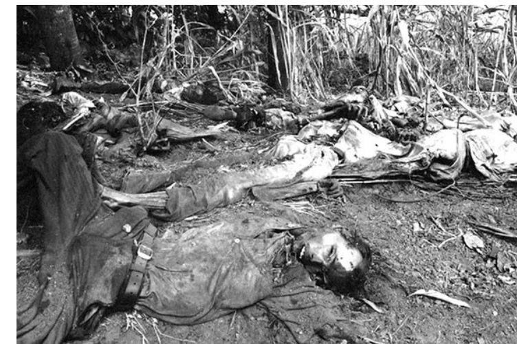
Massacre by U.S.-backed Salvadoran military in El Mozote, December 1981.

Carter (D), Reagan (R), George H.W. Bush (R)