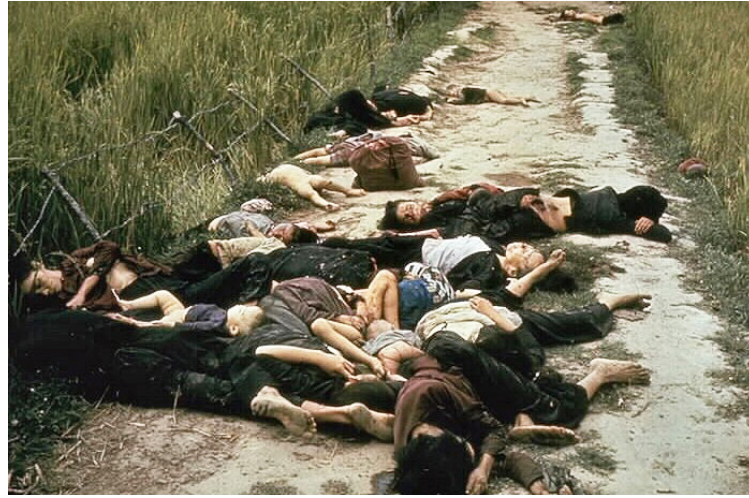
Villagers in My Lai, Vietnam, massacred by U.S. troops, March 16, 1968.

Eisenhower (R), John Kennedy (D), Lyndon B. Johnson (D), Richard Nixon (R), Gerald Ford (R)