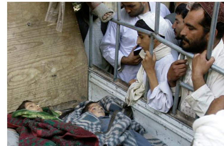
Children killed in U.S. air war in Afghanistan, 2009.

George W. Bush (R), Obama (D), Trump (R)