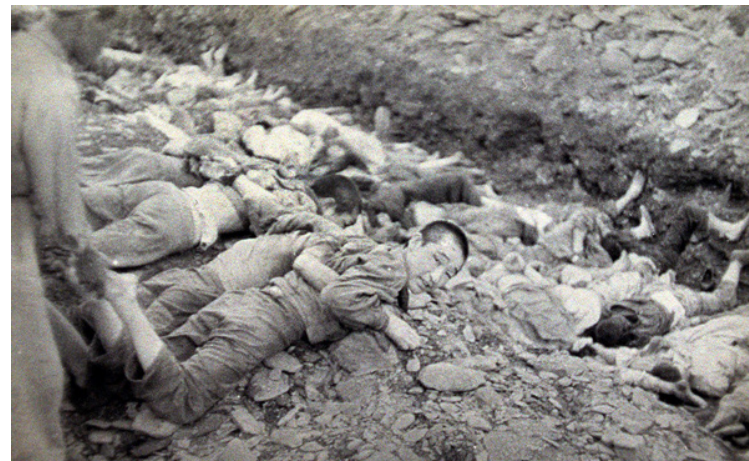
Mass execution of political prisoners by U.S.-puppet South Korean regime, July 1950.

In June 1950, the U.S. orchestrated a United Nations invasion of Korea, and sent over 340,000 American troops. U.S. and U.S.-led forces killed more than two million North Korean civilians, 500,000 North Korean soldiers, and between 900,000 and a million Chinese soldiers. There were also 1.3 million South Korean casualties, including 400,000 dead.