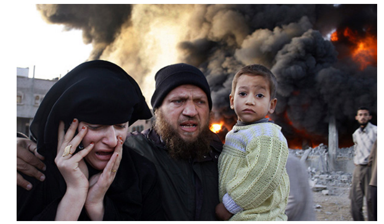
Palestinians in Gaza Strip after Israeli missile strike, 2008.

Truman (D), Johnson (D), Nixon (R), Reagan (R), Clinton (D), George W. Bush (R), Obama (D), Trump (R)