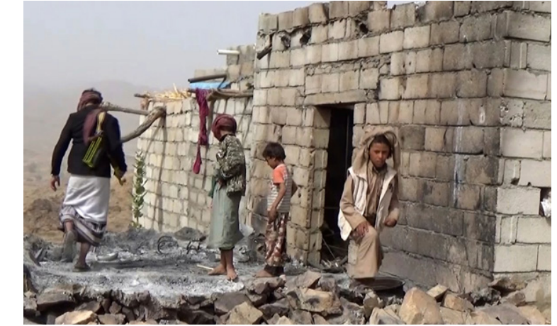
U.S.-backed Saudi Arabia airstrike on Yemen, 2015.

In March 2015, Saudi Arabia, with U.S. backing, launched a war against Yemen's Houthi movement. Since then, between 57,000 and 60,000 have been killed. The Saudis have bombed Yemen's food, water, and medical systems, causing massive hunger and disease. At least 85,000 children have starved to death as a result, and in 2016 and 2017 alone, 113,000 children died of starvation or preventable disease. Fourteen million Yemenis are on the brink of famine.